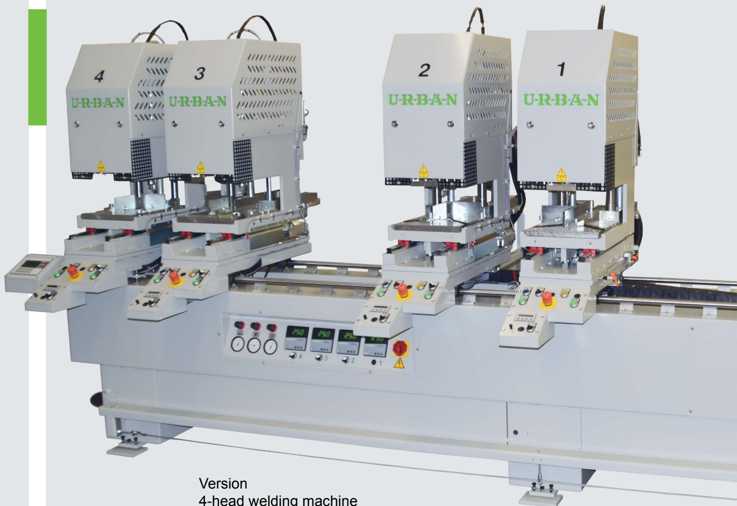
Version 4-head welding machine